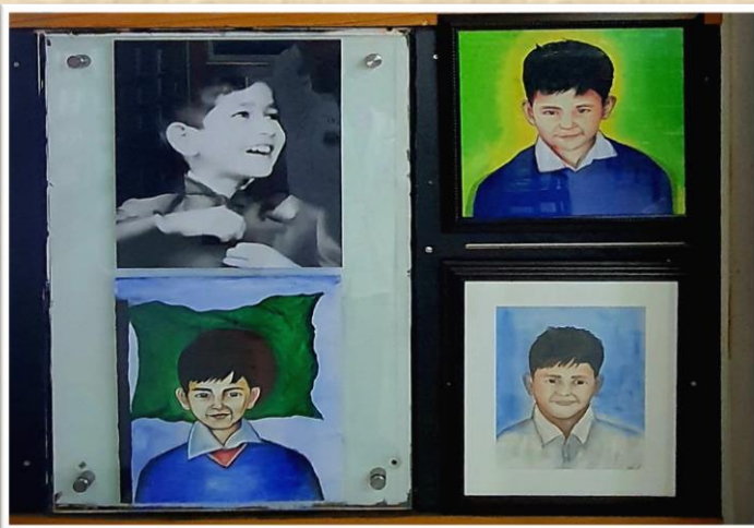
Sheikh Rasel Corner