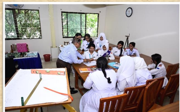
Engineering Drawing Lab