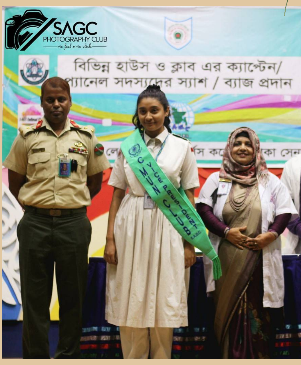
Sash giving ceremony of Batch-23