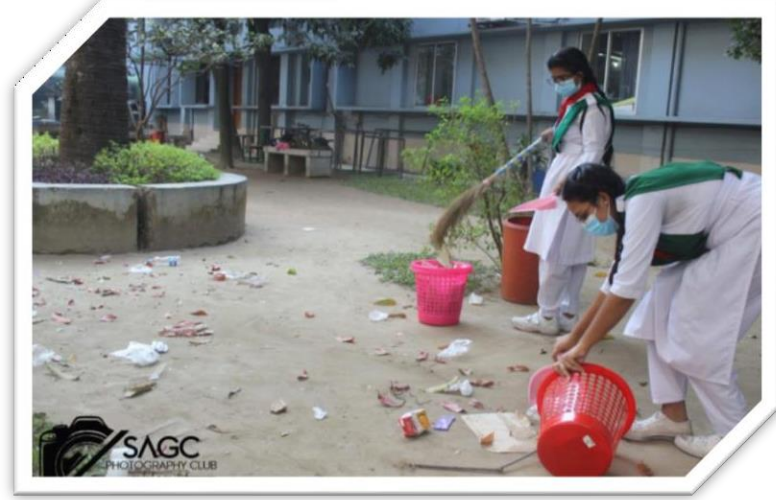
Neat & clean Program