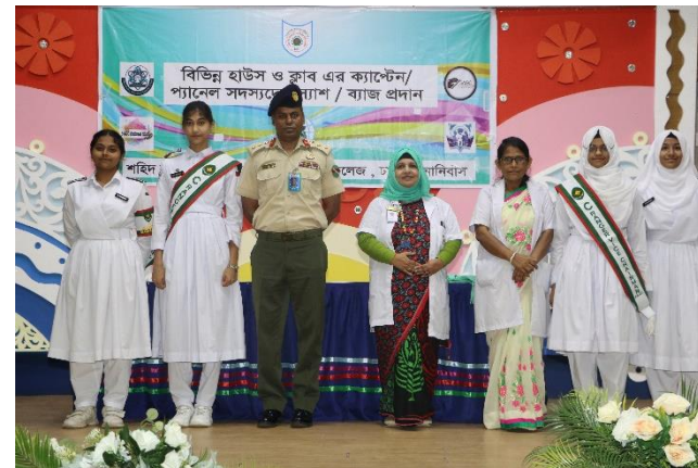
Badge Giving Ceremony