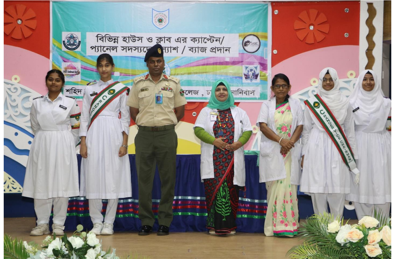
Panel members (2022-23)