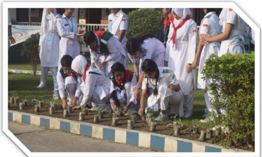
Tree plantation program