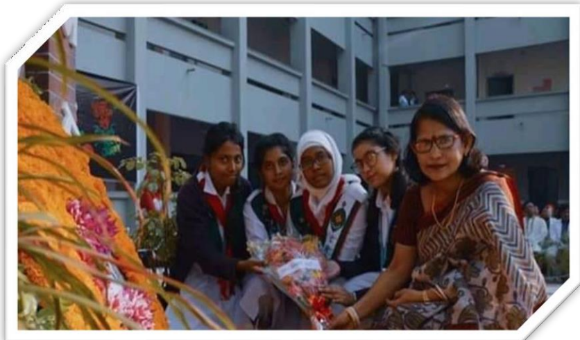
Celebrating Martyrs Day