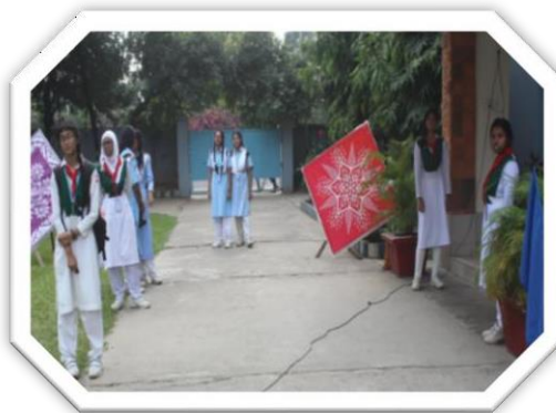
3 rd inter college science fair