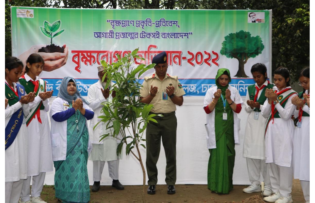
Brikkho Ropon Week 2022