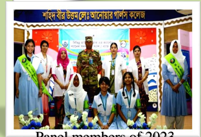
Panel members of 2023