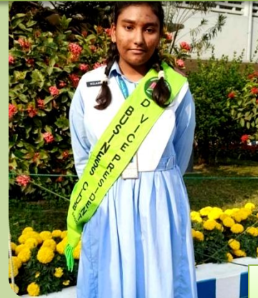
SURRAT SOLAYMAN NILADRI X