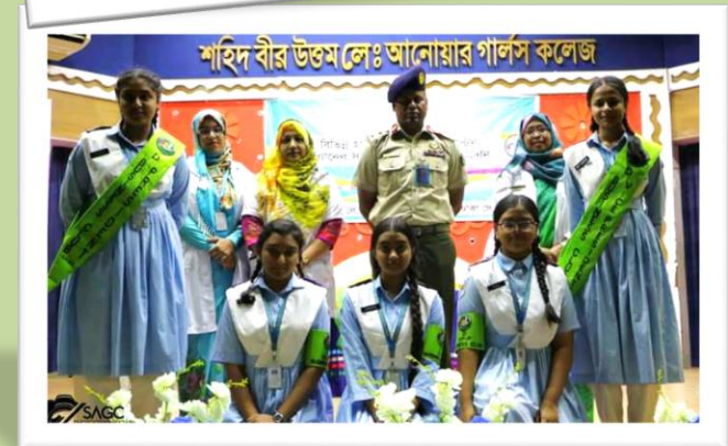
Panel members of 2023